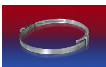
CLAMP 210 BRIDGE CLAMP