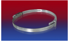
CLAMP 210 BRIDGE CLAMP