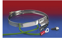
CLAMP 212 EC