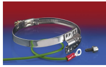
CLAMP 212 EC