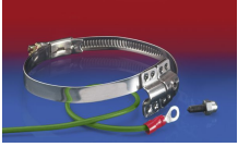
CLAMP 212 EC