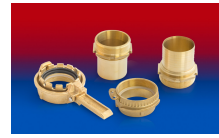
CONNECT TANK TRUCK BRASS 252