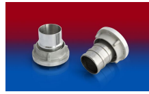
CONNECT STORZ DIN ALU 251