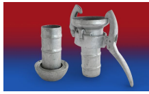
CONNECT KARDAN 254