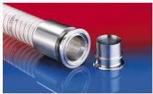
CONNECT PRESS ASSEMBLY 232