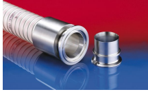
CONNECT PRESS ASSEMBLY 232