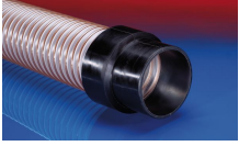
CONNECT 240 EC