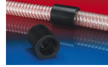
CONNECT 246 AS