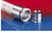
CONNECT PRESS ASSEMBLY 232