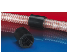
CONNECT 246 AS