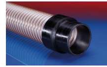
CONNECT 240 EC