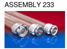
ASSEMBLY 233 CONNECT SAFETY CLAMP ASSEMBLY 231