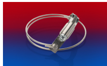
CLAMP 216 FOOD