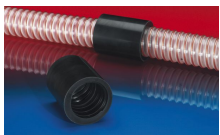
CONNECT 246 AS