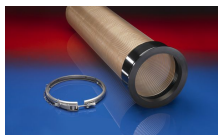
CONNECT 245 VAC-TRUCK