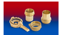
CONNECT TANK TRUCK BRASS 252

Positive and negative pressure ratings are the recommended maximum operating values. Products can be manufactured to meet higher operating values upon request. The bend radius is calculated from the center of the hose in an arched position. Additional information at www.norres.com/us/technology/ . NORRES reserves the right to modify technical data at any time. Technical data based on tests at 68 °F and are approx. values. Proper use and maintenance of NORRES hoses is the sole responsibility of purchaser and ultimate user of the product. The individual conditions, applications and the number of variables make firm recommendations technically impossible. This information is intended as a general guide only.