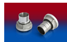
CONNECT STORZ DIN ALU 251