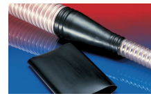
CONNECT 240 + 241