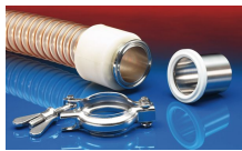
CONNECT TRI-CLAMP FITTING 245