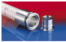
CONNECT PRESS ASSEMBLY 232