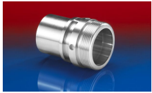
CONNECT THREAD FITTING 234