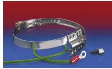
CLAMP 212 EC