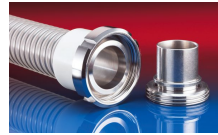
CONNECT MOULD ASSEMBLY 233