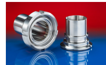
CONNECT ASEPTIC FITTING 249