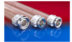
CONNECT SAFETY CLAMP ASSEMBLY 231