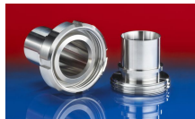
CONNECT DAIRY FITTING 247