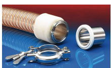
CONNECT TRI- CLAMP FITTING 245