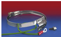
CLAMP 212 EC