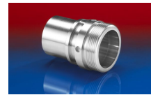
CONNECT THREAD FITTING 234