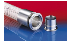
CONNECT PRESS ASSEMBLY 232