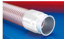
CONNECT 243 FOOD