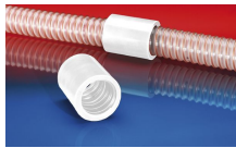
CONNECT 246 FOOD