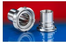
CONNECT ASEPTIC FITTING 249