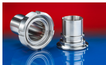
CONNECT ASEPTIC FITTING 249