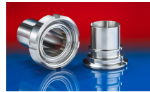
CONNECT ASEPTIC FITTING 249