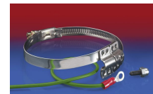
CLAMP 212 EC