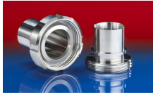
CONNECT DAIRY FITTING 247