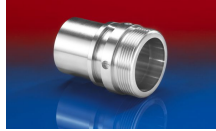
CONNECT THREAD FITTING 234