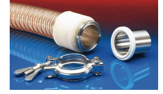
CONNECT TRI- CLAMP FITTING 245

Positive and negative pressure ratings are the recommended maximum operating values. Products can be manufactured to meet higher operating values upon request. The bend radius is calculated from the center of the hose in an arched position. Additional information at www.norres.com/us/technology/ . NORRES reserves the right to modify technical data at any time. Technical data based on tests at 68 °F and are approx. values. Proper use and maintenance of NORRES hoses is the sole responsibility of purchaser and ultimate user of the product. The individual conditions, applications and the number of variables make firm recommendations technically impossible. This information is intended as a general guide only.