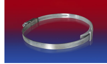
CLAMP 210 BRIDGE CLAMP