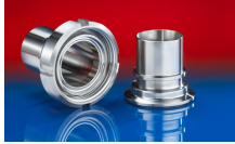
CONNECT ASEPTIC FITTING 249