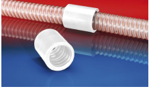
CONNECT 246 FOOD