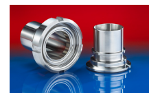
CONNECT Aseptic FITTING 249