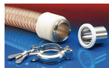
CONNECT TRI- CLAMP FITTING 245