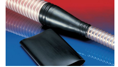
CONNECT 240 + 241 CONNECT 223 FOOD