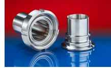
CONNECT ASEPTIC FITTING 249