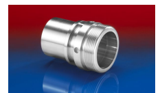
CONNECT Thread FITTING 234

Overpressure and underpressure are recommended threshold operating values, products can be subjected to higher loads upon request. The bending radius is measured through the inside of the hose arch. The right to make technical modifications is reserved. All values determined at 20°C and are approx. data. Additional information at www.norres.com/en/technology/ .