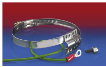
CLAMP 212 EC CLAMP