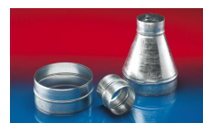
CONNECT 270-271 CLAMP

Overpressure and underpressure are recommended threshold operating values, products can be subjected to higher loads upon request. The bending radius is measured through the inside of the hose arch. The right to make technical modifications is reserved. All values determined at 20°C and are approx. data. Additional information at www.norres.com/en/technology/ .