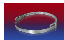
CLAMP 210 BRIDGE CLAMP