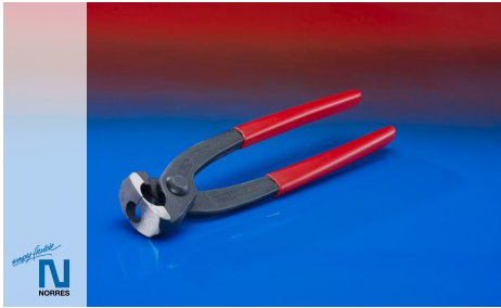
Pliers for assembly of one ear clamps