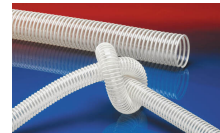
NORPLAST® PUR 385 AS (LD)